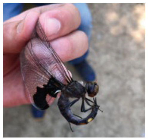
Figure 1. A female Black Saddlebags, my first catch

I would be remiss to not explain why I undertook this project. Odonates, or dragon and damsel flies, form unique keystone predators. They begin their lives underwater as a nymph. During this time they look like true alien creatures, with each having six spiny legs, a water-propelling abdomen, and a xenomorph-like jaw that can detach and grab prey. After a few years, this creature gets bored, climbs the nearest plant, and transforms into the aerial fly we all know today. Each species is a different shape and color, ranging from ocean blue to ruby red, with everything in between. Each species has a specific role in the ecosystem, meaning that knowing what kind of dragonflies are in an area can tell researchers what is going on there. That's where I came in. On every sunny day, I would go out and try to catch as many Odonates as possible, with the goal of meeting all the different members flying around. We caught over forty kinds, with twelve county species records- not bad! But this is too much science--you came for the stories, of which I will share a few.