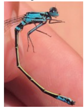
Figure 2. The critically imperiled Lily-pad Forktail. Notice how small it was!

got the feeling you weren't in your own world anymore, as you floated among a mystic ceremony few would observe in a body of water few would ever traverse. After capture, we identified this bug as the Lily-pad Forktail, a critically endangered damsel. In fact, our guidebooks hadn't even listed it as living past Harrisburg, making this experience even more magical.