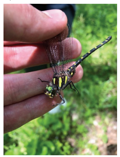
Figure 3. The incredible Twin-spot Spiketail

At this point the dragon got squeamish and picked up speed, breaking the air at what seemed like Mach 3. I'm the only one left, and it's headed straight for me. "This is itswing!" I gave it all I had, torquing out the net like my life depended on it. In the blink of an eye, the dragon collided with the metal rim of my net, knocking itself off kilter. Like a wounded fighter jet, it tail-spun towards the ground, slamming into the water as I yelped in victory. I went to scoop up my waterlogged prize.... only to fall straight face forward into the creek! In all the intensity and focus my boot had become submerged in the muddy creek bottom, trapping me in a moment of hubris. Both the dragon and I recovered in the next second, with the former flying into a nearby tree and I left cursing my bad luck!